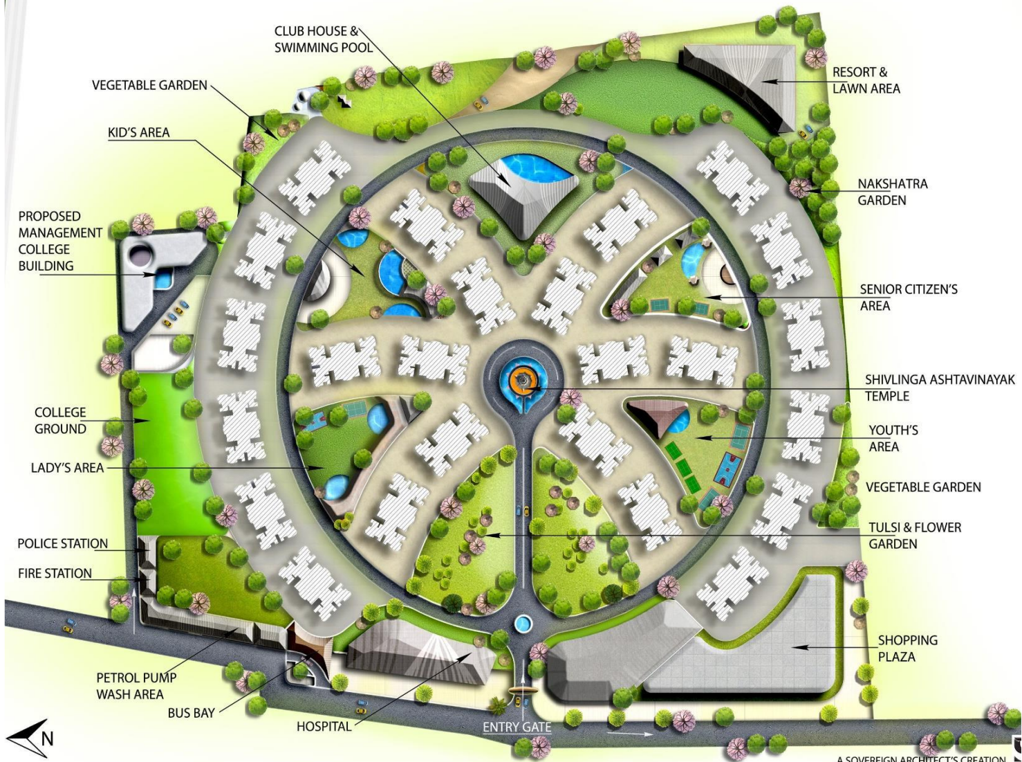
SITE PLAN WAGHOLI 52.5 ACRE